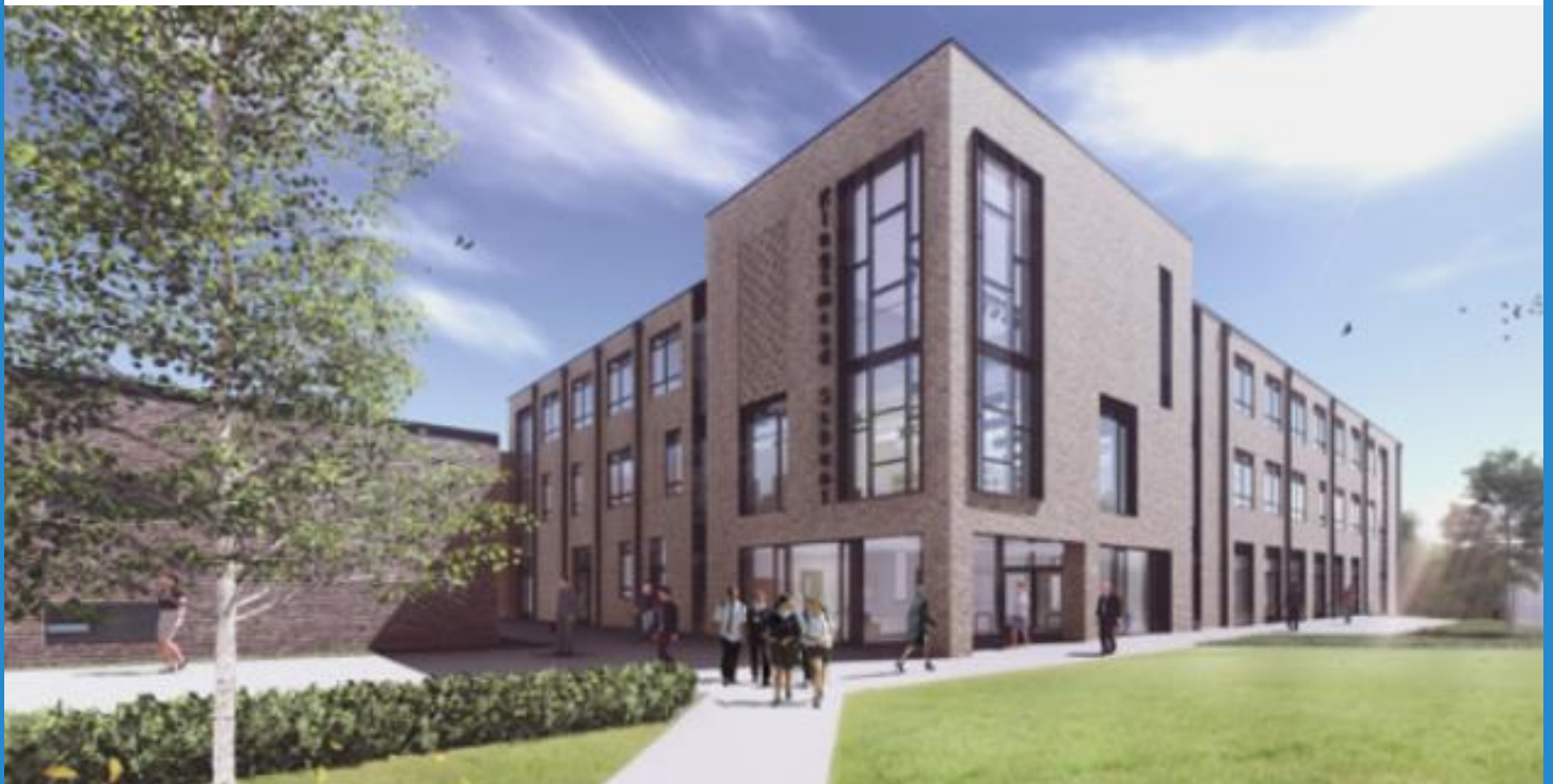
NEW BUILD – OPENED SEPTEMBER 2022